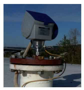
The OPTIFLEX 1300 C measuring on top of the separator

Installed on the roof of the separator, the device is capable of detecting the water interface below the oil layer. It continuously measures the water interface level and automatically transmits the data to the control room.