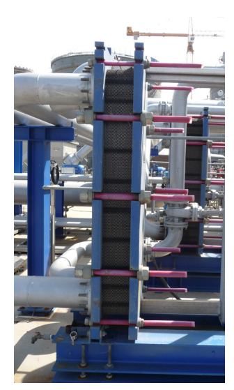
Cooling unit at calibration rig

All three calibration loops have a cooling unit. The calibration loops are connected to the cooling station through 3 cooling lines. These cooling lines are DN 200 / 8" carbon steel pipes. During every calibration process a certain amount of the calibration liquid is required to run through these cooling lines to keep the temperature stable. That's why the customer was looking for a cost effective measuring instrument to measure the volume of the calibration fluid to monitor the amount of liquid running through these cooling units.