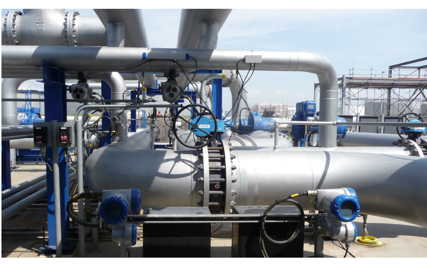
OPTISONIC 6300 with connection box and field housing