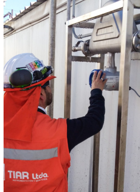
Installation of the flowmeter