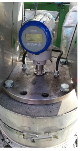
Process water collection tank