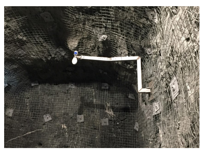
OPTIWAVE 6400 installed above ore pass

The OPTIWAVE 6400 was mounted with a DN150 polypropylene (PP) Drop antenna around 6 m / 19.68 ft above the grizzly bars. This allows the radar signal to travel right through the spacings of the grizzly and hit the rock level in the ore pass. During commissioning an empty spectrum scan was done to cancel weak reflections from the grizzly and thus prevent any negative impact on the performance of the radar level transmitter. In this way, reliable and accurate level measurement is ensured.