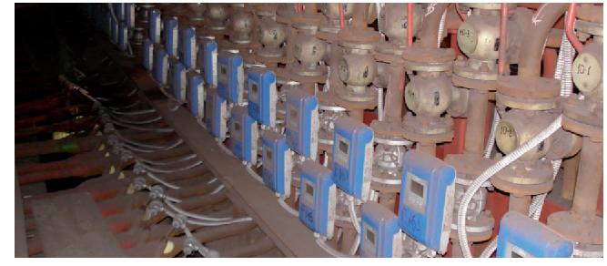
Automated monitoring of coolant leakage in a blast layer