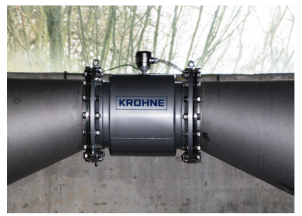
Wall version of converter (left) and sensor (right) of the WATERFLUX 3300 W electromagnetic flowmeter