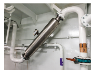
OPTIMASS 2400 F bunker meter

Polarcus was so satisfied as to equip various vessels of their fleet with the KROHNE solution. The shipowner is now able to monitor each vessel type with a single integrated tool. The EcoMATE<sup>TM</sup> system and Coriolis flowmeters provide the customer with continuous, reliable and accurate data, without any need for periodic maintenance. The acquired data help the company optimize engine performance and reduce emissions. In order to monitor fuel oil costs and to be able to verify the amount of fuel oil received during bunkering operation, EcoMATE<sup>TM</sup> provides an overview of all corresponding flow readings. In this way, the system also allows the onboard crew to double check the fuel supplier's delivery information and fuel oil costs. Working together with the main instrumentation vendor KROHNE payed off for the customer. From consultation and project management to the supply of the monitoring system and the flowmeters to the integration of the whole solution into the existing infrastructure of the customer – everything has been provided from one source.