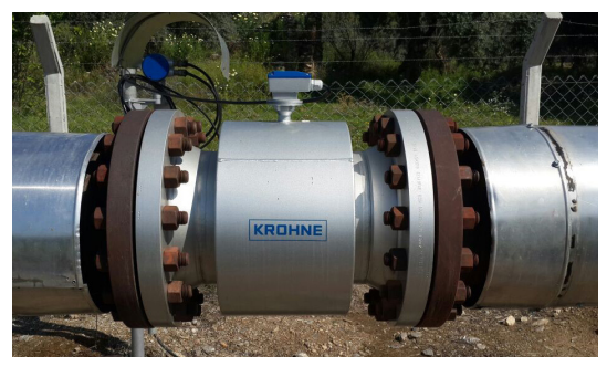
Ultrasonic flow measurement of geothermal brine

Process interruptions due to damaged flowmeters and regular maintenance no longer occur. Unlike with the previously used EMF, the wetted parts of the KROHNE flowmeter are resistant to aggressive media components like H_2S or any vacuum effects. There are