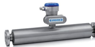
Measuring Sensor OPTIMASS 7000 F