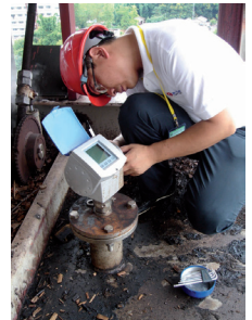
OPTIWAVE 6300 C installation on silo top