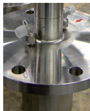
G \frac{3}{8} connections for heating system