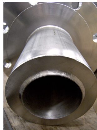
DN 80 antenna with heating system