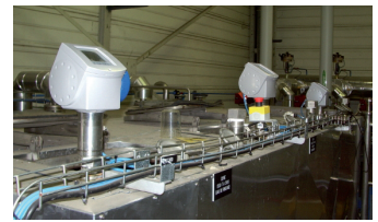
OPTIFLEX 1300 C on storage tanks

20 OPTIWAVE 7300 C FMCW radar level meters with DN 80 (3") flange and antenna are installed on the process tanks and measure the level of the agitated oil surface. 80 OPTISWITCH 5100 C vibrating switches with G1 process connections were added on each tank as additional security to avoid tank overfilling.