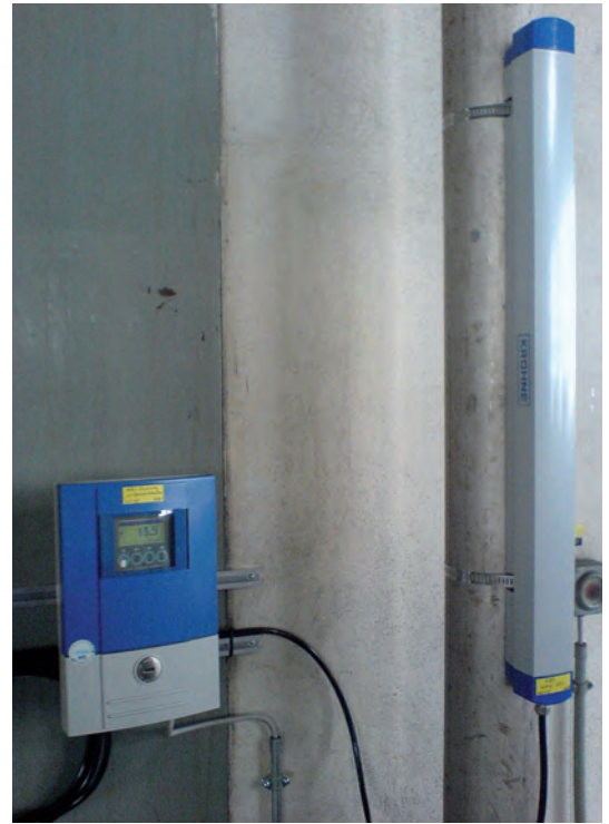
Flow measurement of demi water with the OPTISONIC 6300

The volume flow measurement of the OPTISONIC gives indication about how much WBI has to be provided on a regular basis, thus helping the chemical company to make sure the steam supply remains stable. The customer benefits from reliable measuring results without any process interruption or opening of pipes as the OPTISONIC 6300 sensor has integrated fixing units and transducers. An additional advantage was that the ultrasonic flowmeter is easy to install and doesn't require any special training. The chemical company has been using the OPTISONIC 6300 since 2006 without any need for maintenance.