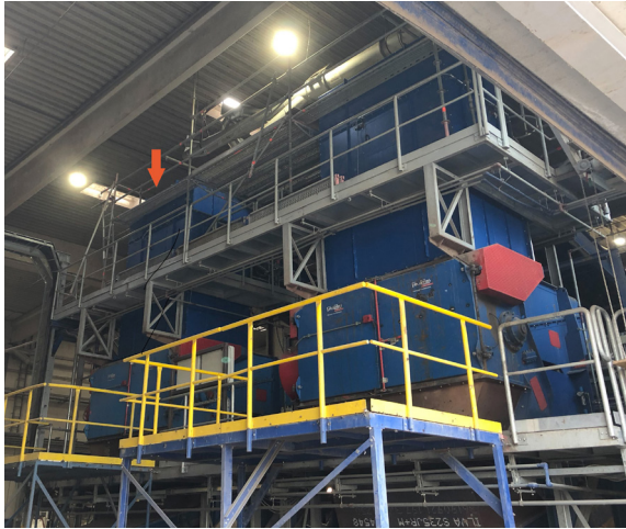
Waste container with the measuring point of the OPTIWAVE 6500 (red arrow)

The customer installed the OPTIWAVE 6500 C. The 80 GHz (FMCW) radar level transmitter was fitted on top of the waste silo using a flange connection. Thanks to its PEEK lens antenna (DN70) the level radar is ideal for use in the damp and dusty environment of the waste container. Due to the flush-mounted installation there is no intrusion of the antenna into the container. This ensures there are no troublesome deposits or build-ups.