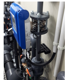
OPTIFLUX 5100 for dosing of sodium hypochlorite solution

In addition, the pumping station for the treated water was equipped with the OPTIFLUX 2100 C. Two units of the EMF were supplied with flange connections from DN25...50 for a water flow rate of 350...900 l/h. This flowmeter for general water applications has a wear resistant liner and a full-bore design. It is thus almost maintenance-free, which makes it an effective replacement of the mechanical water meters used before.