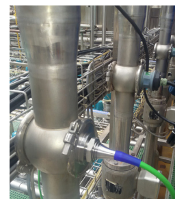
Inductive conductivity measurement of cleaning agents