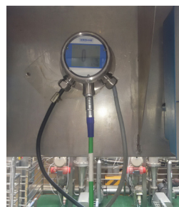
OPTISYS IND 8100 shortly after commissioning