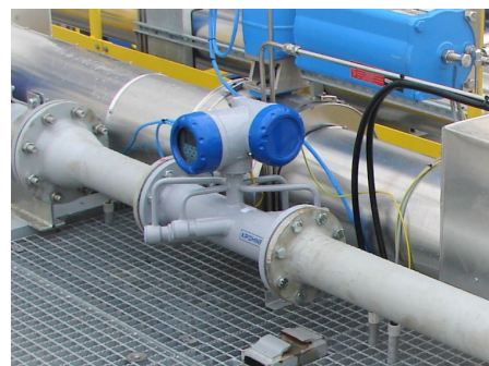
Flow measurement of hydrogen with the OPTISONIC 7300 ultrasonic flowmeter

The flowmeter was calibrated with air at atmospheric pressure prior to delivery and installed in the DN100 pipeline located in an outdoor hazardous area. The ultrasonic flowmeter was therefore supplied in an intrinsically safe design. Due to its 2-path configuration, the straight inlet run of the flowmeter was only 10DN, reducing the installation effort. The readings from the OPTISONIC 7300 are transmitted via 4...20 mA to the control room, where the flow rate is converted to standard conditions using existing pressure and temperature measurements.