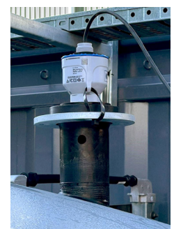
OPTIWAVE 1540 mounted on long tank nozzle