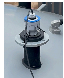
Level measurement in poly tank

Commissioning was quick and easy via smartphone and secure Bluetooth® using the KROHNE OPTICHECK Level Mobile app. The app guides the user step-by-step through the installation process, offering pre-configurations for various level applications and tank geometries. It only had to be filled with the parameters of the application such as measuring range and distance between radar antenna and tank bottom.