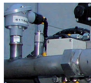
Temperature sensor on swivel arm of spray nozzle