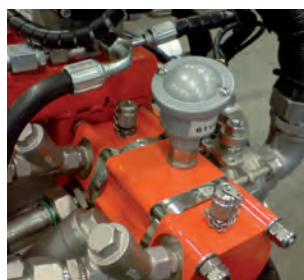
Temperature sensor on telescoping arm

KROHNE's ability to quickly and easily supply all temperature sensors and transmitters, even the special versions, was a big advantage for SAFEAERO. No maintenance and reliable temperature measurements guarantee smooth use throughout the entire winter. Replacements are sent without delay. Exact temperature measurements reduce glycol consumption which, in turn, protects the environment as well as giving the customer an economic benefit.