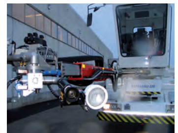
Cabin and swivel arm on vehicle

Depending on weather conditions, aircraft must be de-iced to ensure safe operation in the winter. This task is performed using SAFEAERO de-icing vehicles, which are available in different versions and sizes. All vehicles are designed for one-man operation. They are equipped with 2–7 tanks totaling a volume of up to 14000 litres. A single tank can have a maximum capacity of 4500 litres. The glycol/water mixing ratio can be adapted directly on site depending on weather conditions.