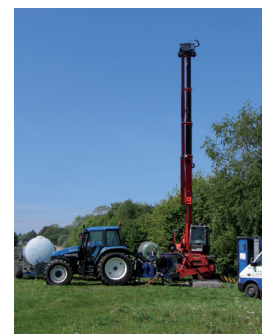
Maintenance skid with crane

At many locations where Q-FLOW operates, like meadows and forests, mains power is often not available. Any savings on the use of power and aggregates is preferred. Q-FLOW requires accurate flow measurements for well maintenance activities and for building new wells. To check the result of a well treatment, the calibrated volume of water abstracted from a well is an important measure for how much the water level is reduced. Local regulations are in place to ensure that the water balance is maintained at its target level. As a result, the amount of water to be abstracted is often limited. In addition, Dutch regulations on water discharge demand that in case of well maintenance, such as cleaning under high pressure and chemical regeneration, the volume of water that is pumped and discharged during the treatment is to be measured accurately.