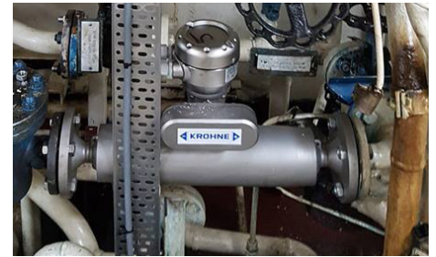
OPTIMASS 1010 flowmeter on board Africa Mercy

EcoMATE™ also guarantees that EU and IMO's mandatory regulations on the monitoring, reporting and verification (MRV) of carbon dioxide emissions are fully met. Using the EcoMATE™ Cloud module allows the customer to automatically send their consumption data to a cloud solution, enabling on-shore staff to monitor ship specific fuel usage or voyage reports.