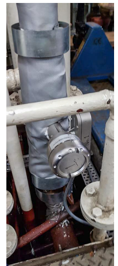
Flow measurement with OPTIMASS 1010