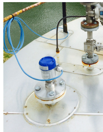
Measuring gauge pressure of the nitrogen layer

The customer stores ester in several tanks at its European sites. The ester is covered with a layer of inert gas (nitrogen) to protect it against oxidation. There is a slight gauge pressure in the tank (between 0...25 mbarg / 0...0.36 psig), which the customer must continuously monitor by way of relative pressure measurement at the top of the tank. If the gauge pressure cannot be measured, there is a risk of air intake. If oxygen gets into the tank, it can cause the ester to oxidise. This is a new application for the customer, there was no previous measuring point for this parameter. The temperature in the tank is +80°C / +176°F. ATEX-approved measuring devices were required for this application.