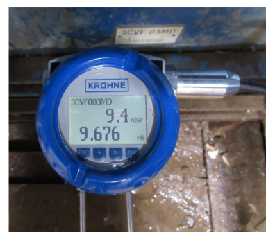
OPTIBAR DP 7060 C IP 68 measuring raw water intake

After two years of operation the customer confirms the reliable operation and is fully satisfied with the improvement of the situation. The maintenance costs for these measuring points have been cut off significantly since personal access to the pits can now be refrained from.