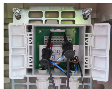
Junction box SJB 200