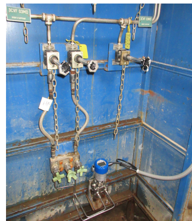
OPTIBAR DP 7060 C differential pressure transmitter

Once installed into the horizontal concrete pipes, the units were configured via the junction box. Thus, setting up the devices in the wet, dark and difficult-to-access pit was avoided.