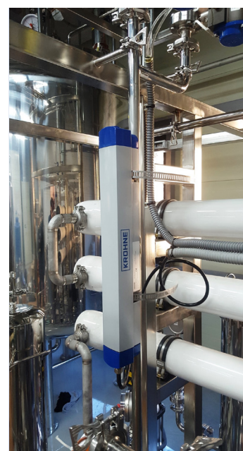
Clamp-on flowmeter measuring Water for Injection (WFI)

Given that the OPTISONIC 6300 is a non-calibrated flowmeter and did thus not need to be customized, delivery was very fast.