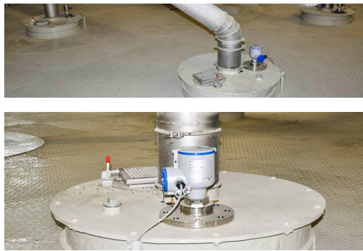
Installation next to filler neck