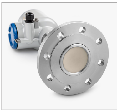
OPTIWAVE 6500 C with flush-mounted PEEK antenna

The measuring device was flush-mounted with a PEEK lens antenna (DN70). There is no intrusion into the tank. This way, the level transmitter measures with virtually no dead zone so that the silo can be filled to the roof. It is installed just 20 cm / 7.8 inch from the filler neck used to fill the silo.