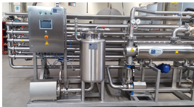
ÜNSA Makina CIP system