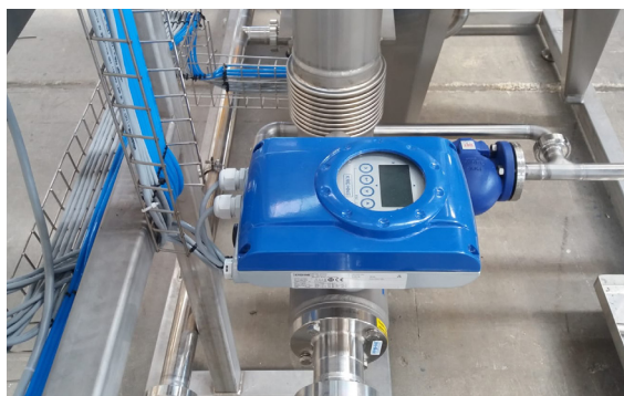
OPTIFLUX 6050 C on CIP skid unit

The KROHNE device has also no crevices, gaps or blind spots and is specifically designed to stay free of contamination. This way, it complies with the most stringent hygienic demands in the food and beverage industry. To meet the customer's requirements in terms of process connection, all flowmeters were equipped with DIN 11851 hygienic connection.