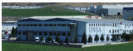
Ünsa Makina manufacturing plant

The Turkish company Ünsa Makina engineers and builds turnkey equipment for food producing companies. Among other things, the company specialises in the design and manufacture of CIP (Cleaning in Place) units. The CIP plants are completely equipped ex works with instrumentation in accordance with customer specifications.