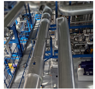
Insulated district heating pipe with flow straightener and ultrasonic flowmeter