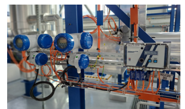
Field-mounted converters of the OPTISONIC 3400 District Heating next to a flow computer