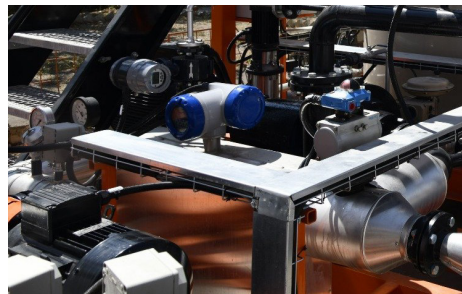
Flow measurement of bitumen with OPTIMASS 6400 Coriolis mass flowmeter