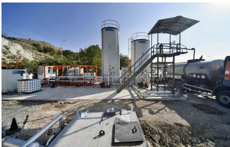
Bitumen emulsion plant with cold asphalt tanks and sprayer truck loading

The emulsifying solution, basically a mixture of emulsifier, water, hydrochloric acid and aggregates, is a conductive fluid and thus an ideal application for robust and cost-effective electromagnetic flowmeters (EMF). The OPTIFLUX 4050 proved to be the EMF that provides the sufficiently repeatable flow measurement needed for the dosing procedure.